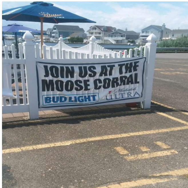
Ortley Beach Moose Corral

JOINT BOARD OFFICER'S MEETING 6:30 PM...1 ST WEDNESDAY LOOM GENERAL MEETING 7 PM.....3 RD WEDNESDAY WOTM CHAPTER MEETING 6:30 PM.....2 ND WEDNESDAY WOTM BUSINESS MEETING 6:30 PM.....4 TH WEDNESDAY