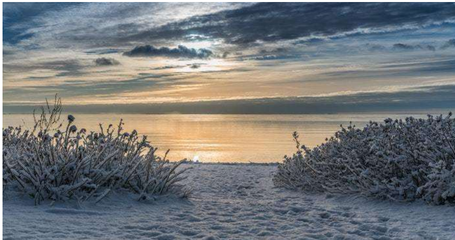
WINTER AT THE JERSEY SHORE

JOINT BOARD OFFICER'S MEETING 6:30 PM...1 ST WEDNESDAY LOOM GENERAL MEETING 7 PM.....3 RD WEDNESDAY WOTM CHAPTER MEETING 6:30 PM.....2 ND WEDNESDAY WOTM BUSINESS MEETING 6:30 PM.....4 TH WEDNESDAY