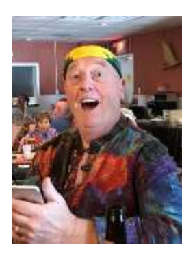
FEELING & LOOKING GOOD