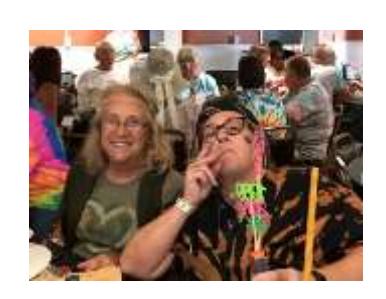
A LITTLE SMOKIN'