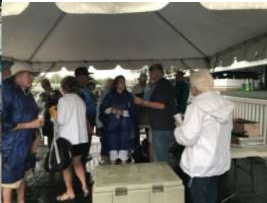
WE ALL FOUND ROOM UNDER THE TENT