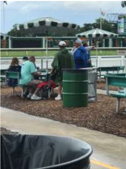
RAIN GEAR ONHAND