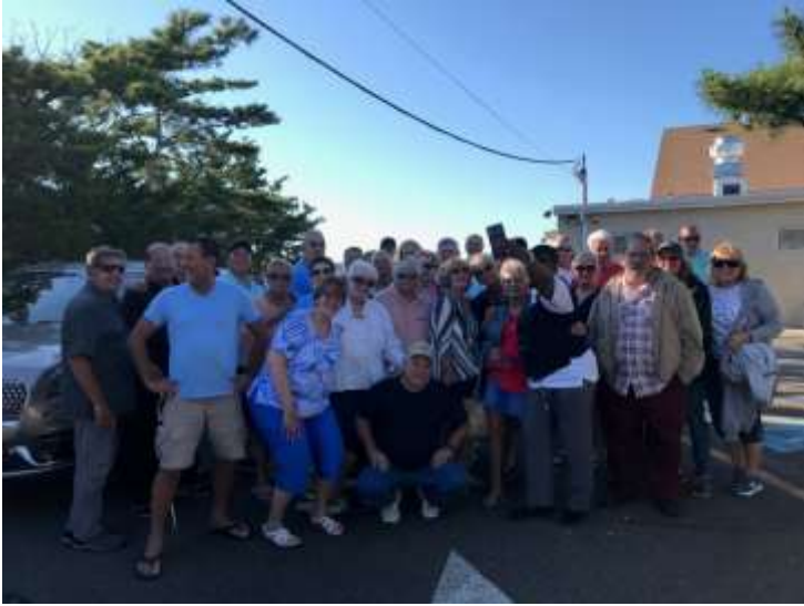
BACK AT THE LODGE