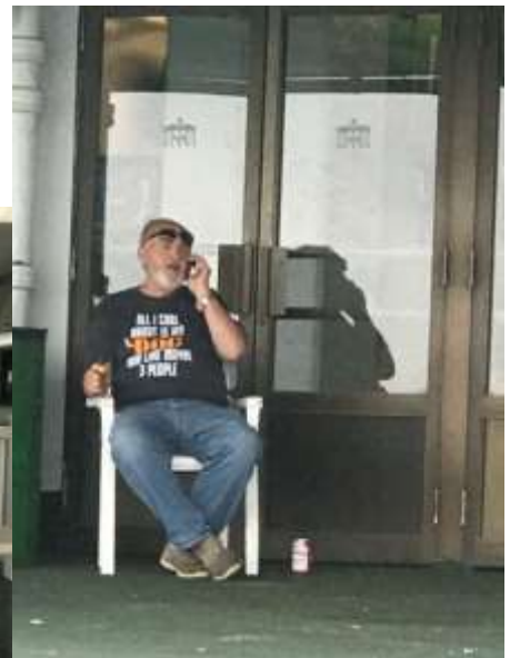
OUR ADMINISTRATOR, ALWAYS WORKING