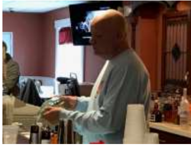
Our back Bartender