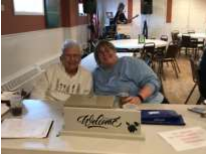
Our welcoming ladies

SEASIDE POLAR BEAR PLUNGE, FEBRUARY 23, 2019