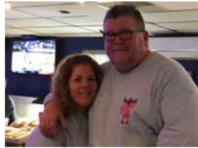
Our front Bartenders