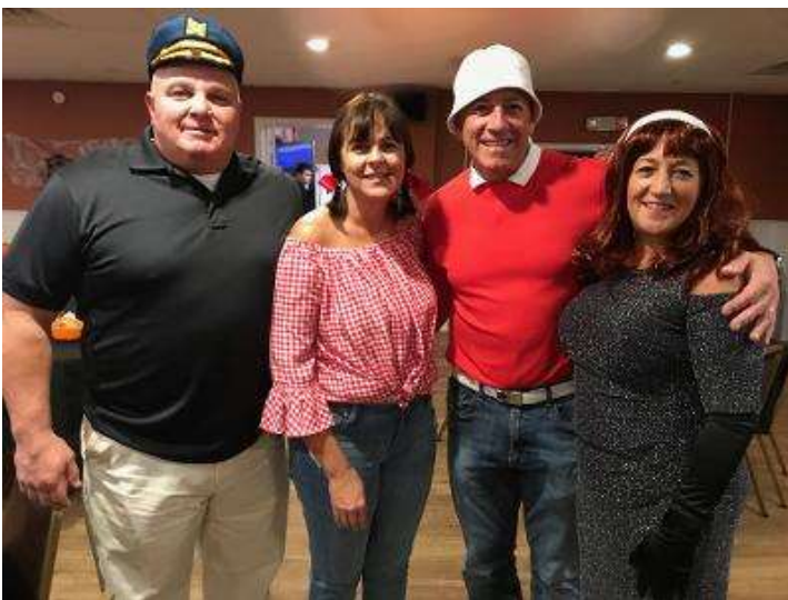
THE SKIPPER, MARY ANN, GILLIGAN & GINGER