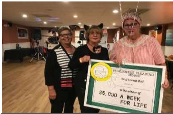
A BAT, A DEVIL & A PUBLISHER CLEARING HOUSE WINNER