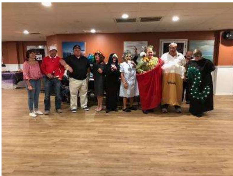
SOME OF THE CONTESTANTS