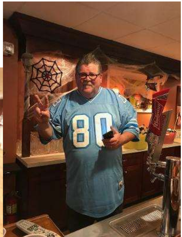
STELLAR WIDE RECEIVER