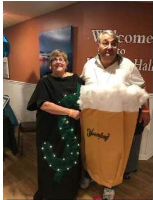
$ DRAFTS HERE