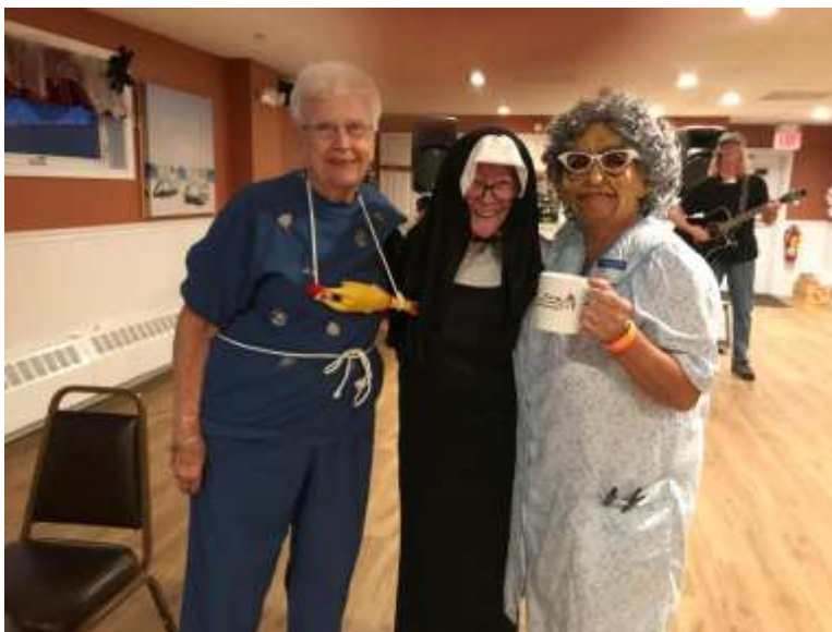
CORDON BLEU, THE NUN, OLD ANGRY LADY