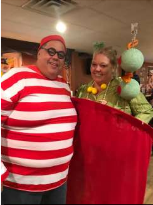
WHERE'S WALDO? WITH A BLOODY MARY